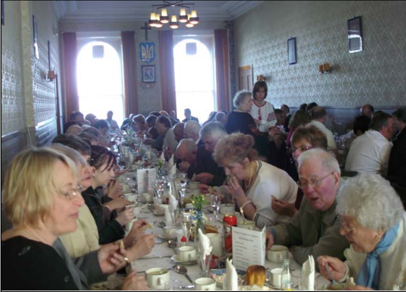
A full house packed out the club for Easter Sunday Dinner